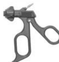
TYPE 9: LIGHTWEIGHT CARBON-FIBER W/ RF POST, W/ LARGE FINGER LOOPS