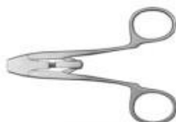
TYPE 11: STAINLESS STEEL RING AXIAL HANDLE