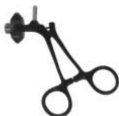
TYPE 14: INSULATED STAINLESS STEEL LINVATEC-WECK STYLE W/ LONG SHANKS