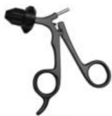
TYPE 1: INSULATED WITH RF- POST