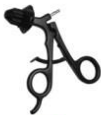
TYPE 2: INSULATED W/ RF- POST & RATCHET