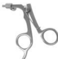
TYPE 16: NON-INSULATED STAINLESS STEEL W/ SPRING ASSIST CLOSING