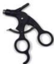
TYPE 6: LIGHTWEIGHT CARBON-FIBER w/ RF-POST & RATCHET