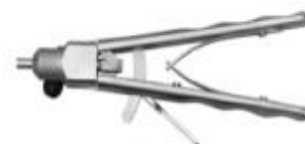
TYPE 13: STAINLESS STEEL AXIAL HANDLE w/ PRECISE ENGAGEMENT RATCHET