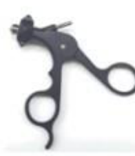
TYPE 18: CARBON-FIBER W/ RF POST