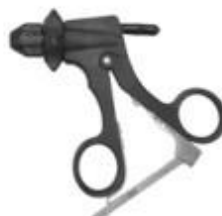
TYPE 8: LIGHTWEIGHT CARBON -FIBER W/ RF POST, FRENCH ON/OFF RATCHET