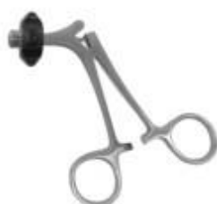
TYPE 15: NON-INSULATED STAINLESS STEEL LINVATEC-WECK STYLE W/ QUICK RELEASE RATCHET & LONG SHANKS