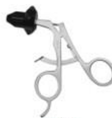
TYPE 4: NON-INSULATED STAINLESS STEEL W/ RATCHET