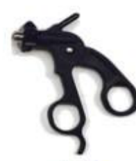
TYPE 5: LIGHTWEIGHT CARBON-FIBER W/ RF POST