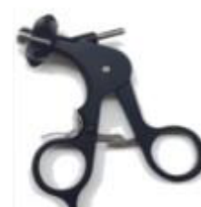
TYPE 18: CARBON-FIBER W/ RF POST, RATCHET / RATCHET DEFEATING