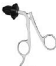
TYPE 3: NON-INSULATED STAINLESS STEEL