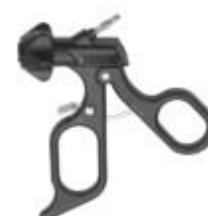
TYPE 10: LIGHTWEIGHT CARBON-FIBER W/ RF POST, RATCHET / RATCHET DEFEATING W/ LARGE FINGER LOOPS