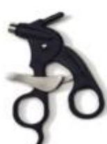
TYPE 7: LIGHTWEIGHT CARBON-FIBER W/ RF POST, RATCHET / RATCHET DEFEATING