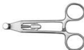
TYPE 12: STAINLESS STEEL RING AXIAL HANDLE w/ RATCHET